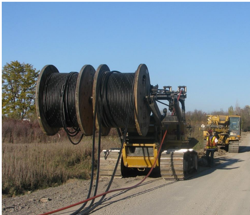
Figure 6 - Trenching and Cable Placement