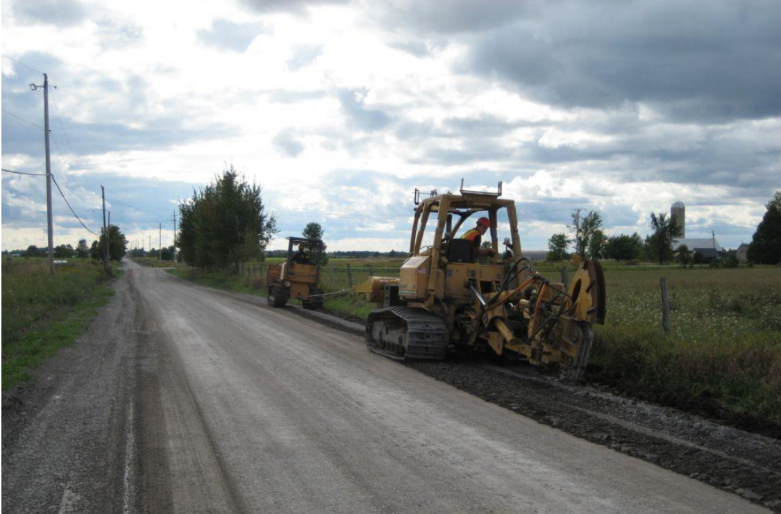
Figure 7 - Roadside Plowing

Road Closures: Full closures of public road segment(s) (each, a “Road Closure”) will be required at various instances during construction of the Project or municipal road reconstruction. Road Closures are planned to occur during normal working hours. If the duration of a Road Closure continues for more than thirty minutes after sunset, area illumination will be provided in accordance with applicable regulations. Road Closures will not be left in place overnight.