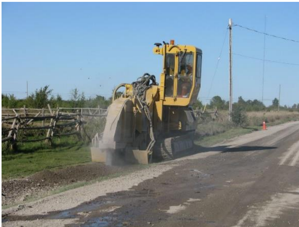
Figure 4 – Trenching Operations

For illustration purposes, examples of typical electrical collector system installation activity execution within a single traffic lane are provided in Figure 4 through Figure 7 below.