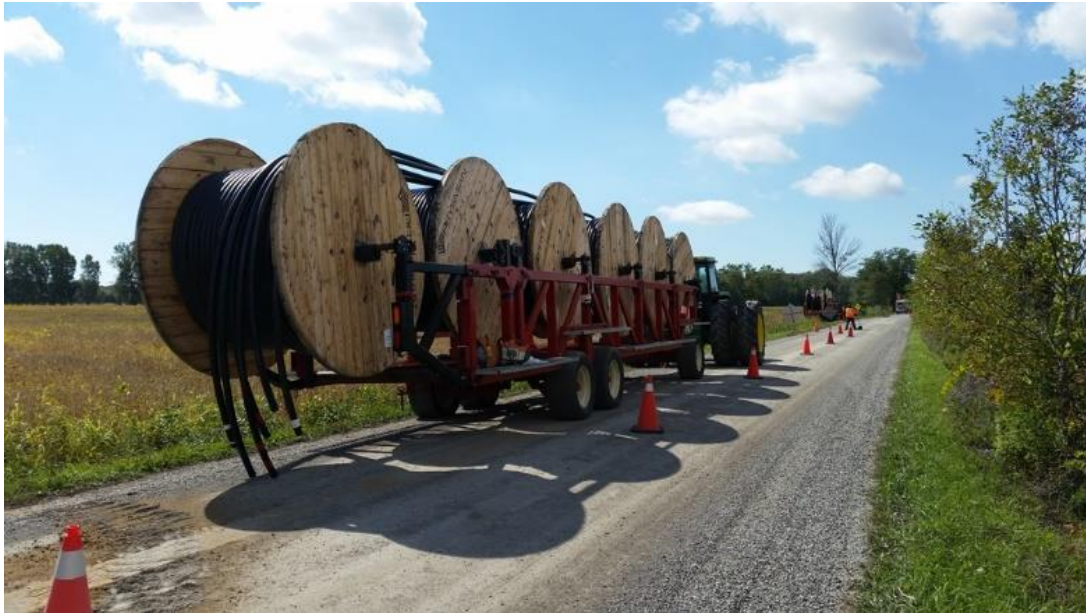
Figure 5 - Cable Spool Trailer